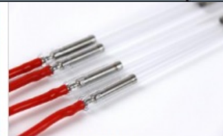
German HERAEUS xenon lamp