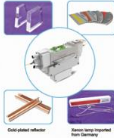
Gold-plated reflector Xenon lamp imported from Germany