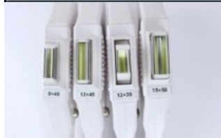
Different spot sizes to choose from