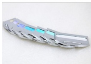
Several light filters to choose from