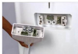
American imported fast plug-in