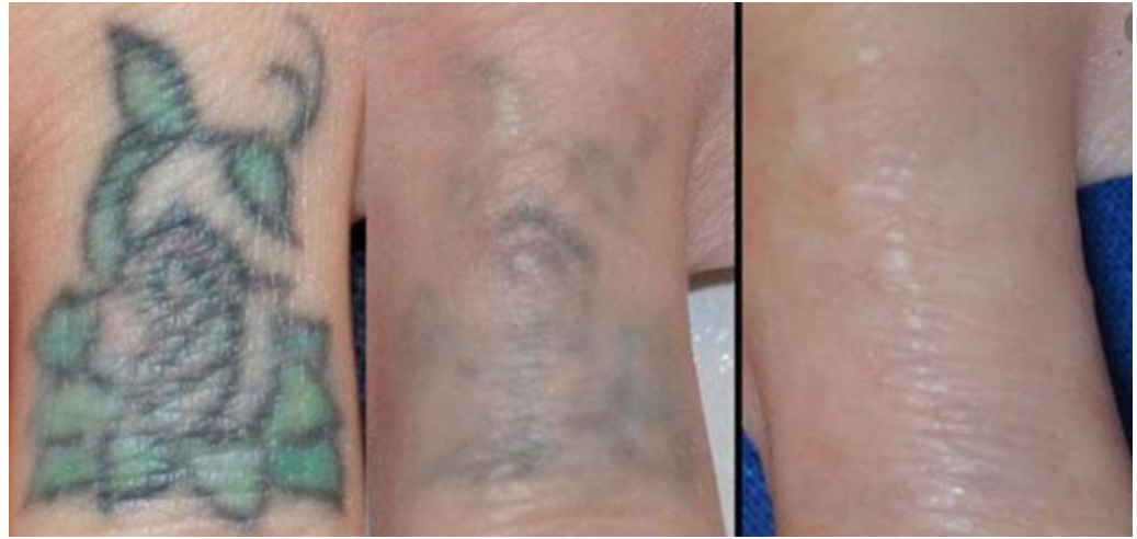
Application of q switched nd yag laser

ND\ YAG\ laser: \underline{tattoo/eye\ embroidery/eyeline/freckles\ removal\ and\ skin\ whitening.}