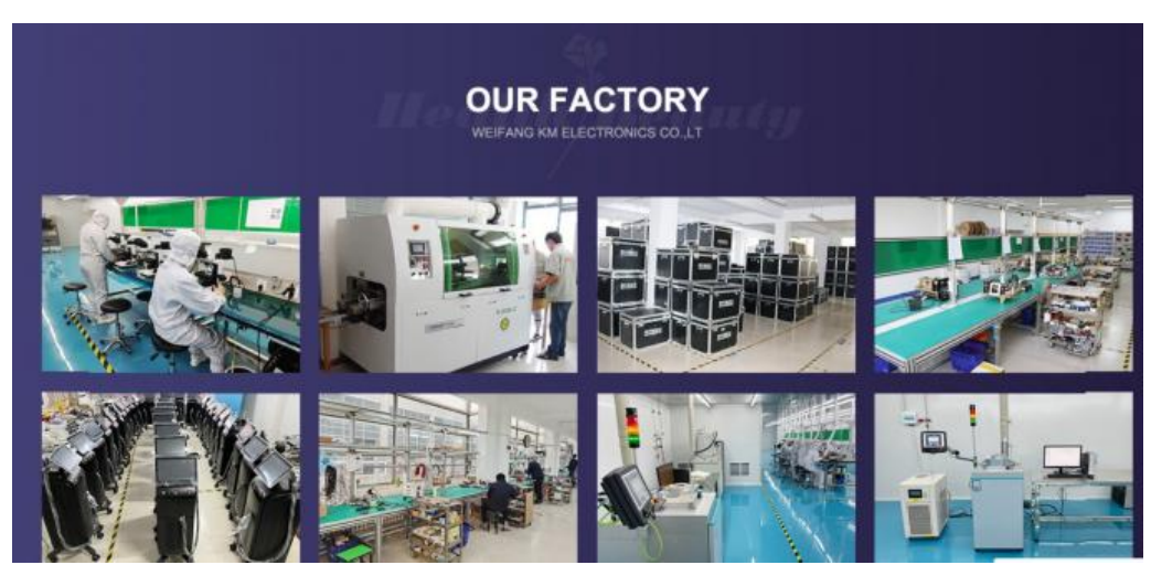
Are you a beauty salon? distributor? or a trading company?

Our factory provide OEM, ODM services, for more information, please send inquiry!