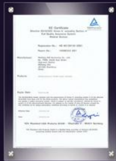
TUV medical CE