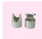
Vascular removal plug 2