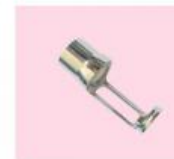
Nails fungus removal plug 1