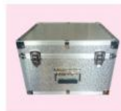
Flight case 1