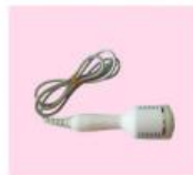
Ice compress hammer 1