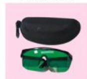
Laser safety glasses 1