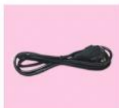
Power Line 1