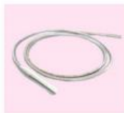
Hand piece 1