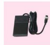
Foot switch 1