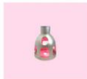
physiotherapy plug 1