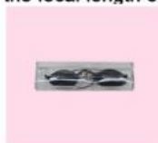
Eye mask 1