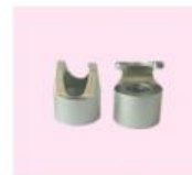
Vascular removal plug 2