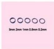
Ring for adjusting the focal length 5