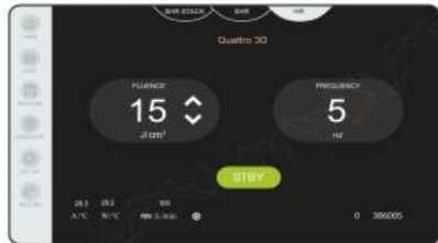
HR mode: Professional mode for beauticians