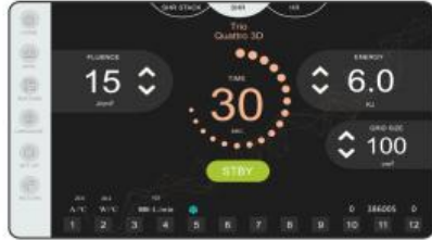
SHR Mode: Simple treatment mode for beginners