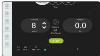
SHR stack mode: Professional mode for doctors