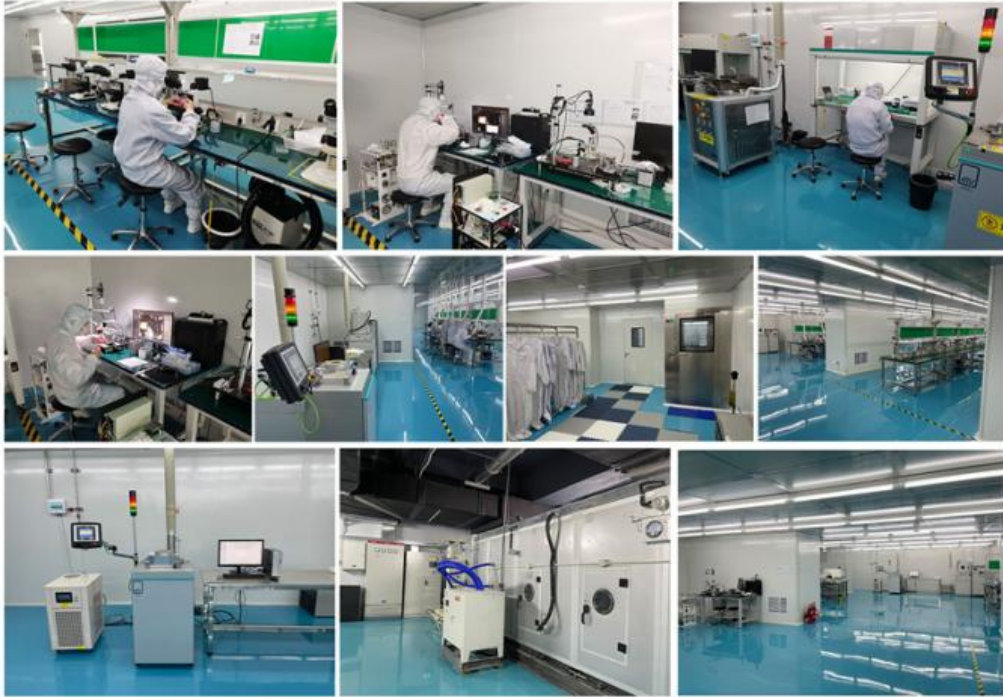
DUST-FREE WORKSHOP OF LASER MODULE ASSEMBLY FOR LONG SERVICE LIFE